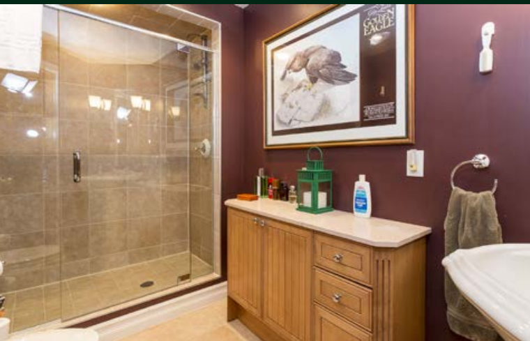
Lower level billiards, bar and bathroom.