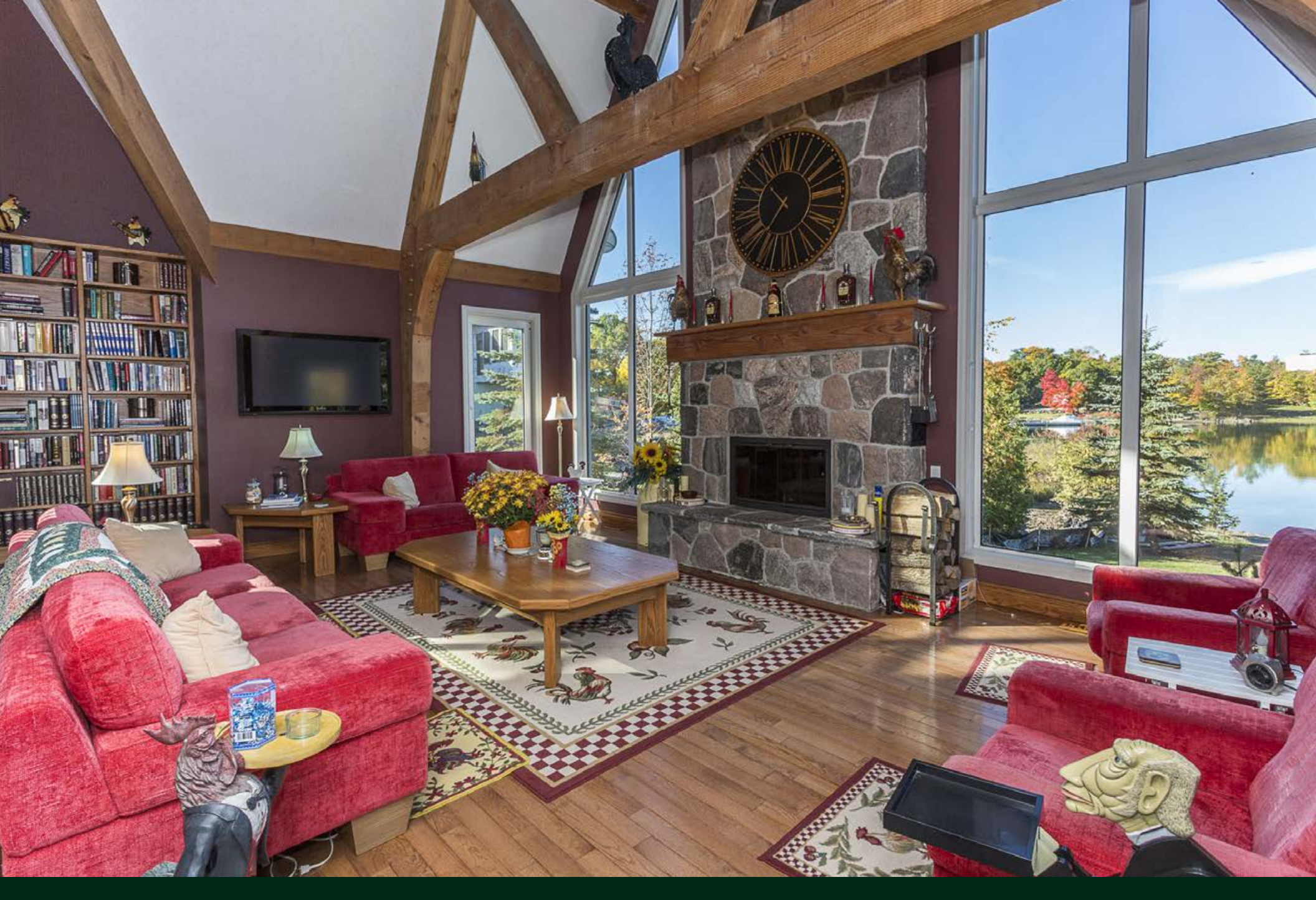
Views to the west from the living room... floor to ceiling granite fireplace.